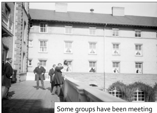
Some groups have been meeting there longer than CCCMA!

We continue to try to mitigate the largest issues that make people ask the above question! The experiment of live streaming into a second room was successful and there will definitely be a second bar for the happy hours.