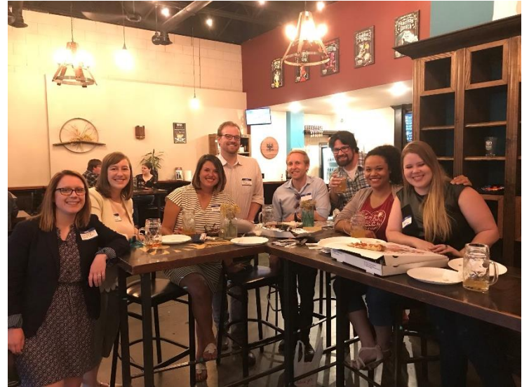
June 28: Networking Event