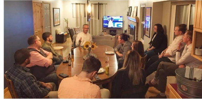
Oct 19: Manager Spotlight