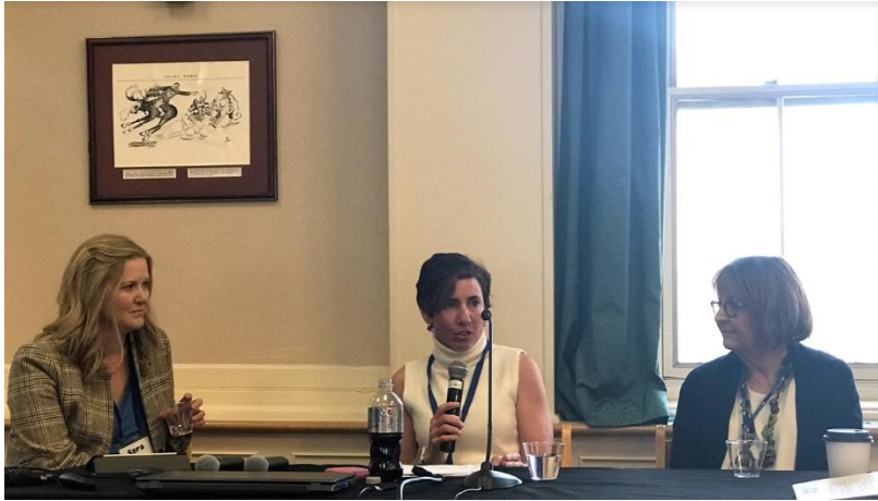
CCCMA Lunch: The Power of Inspirational Leadership