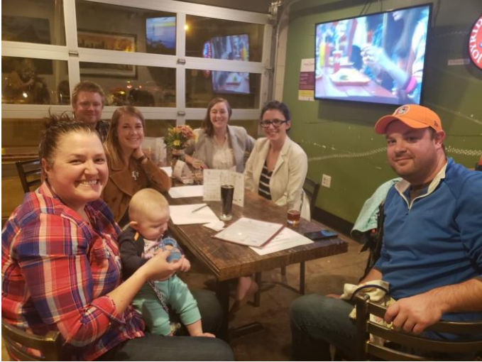
Oct 17: Networking Event