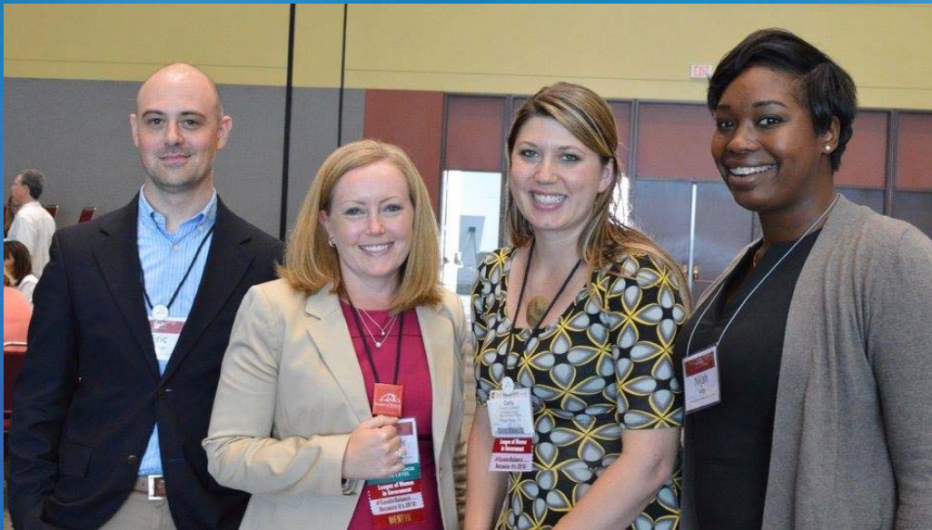
Julie Underwood @UnderwoodJulie